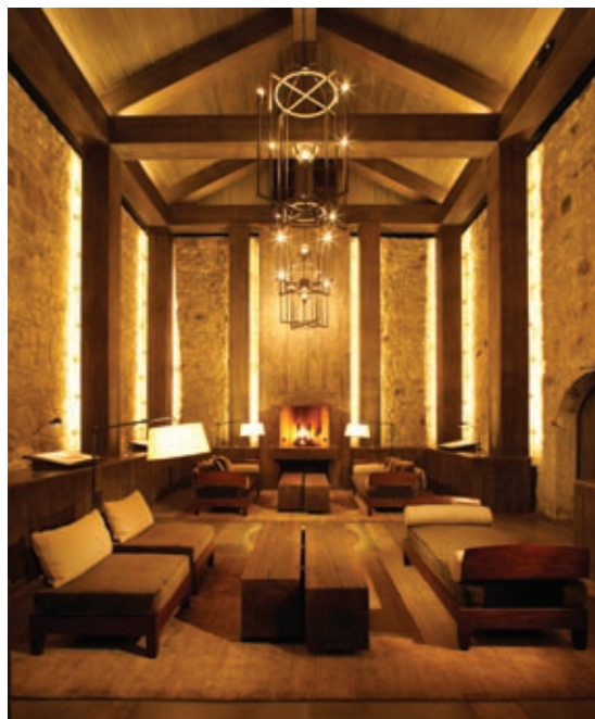
Photo courtesy of Dana Estates (left); photo by Erhard Pfeiffer (right)