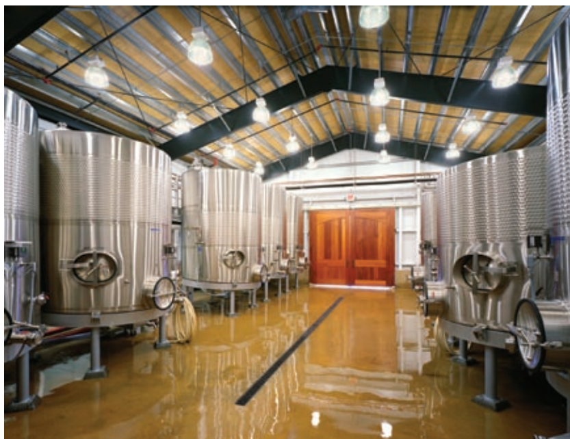
Vine rows (top) and tank room (above) at Revana Family Vineyard.