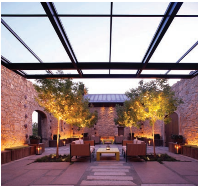
Courtyard (above) and dining room (below) of Dana Estates.

Dana is no temple of ostentation; its quiet luxuries are those of space and attention to detail. For example, the 20,000-square-foot barrel room is far larger than its case production (roughly 600 per year) would demand; that’s because no barrels are stacked. Three different