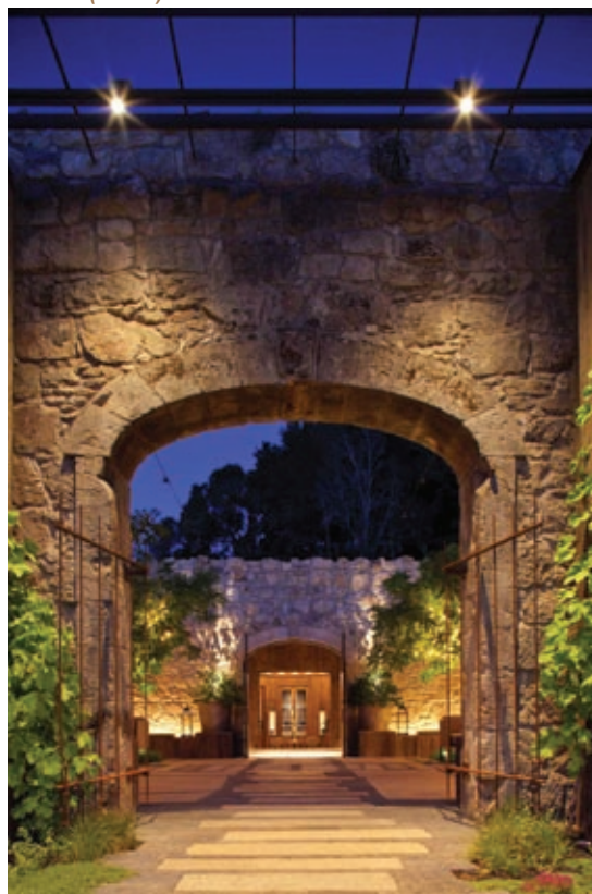
Photo courtesy of Dana Estates (left); photo by Erhard Pfeiffer (right)